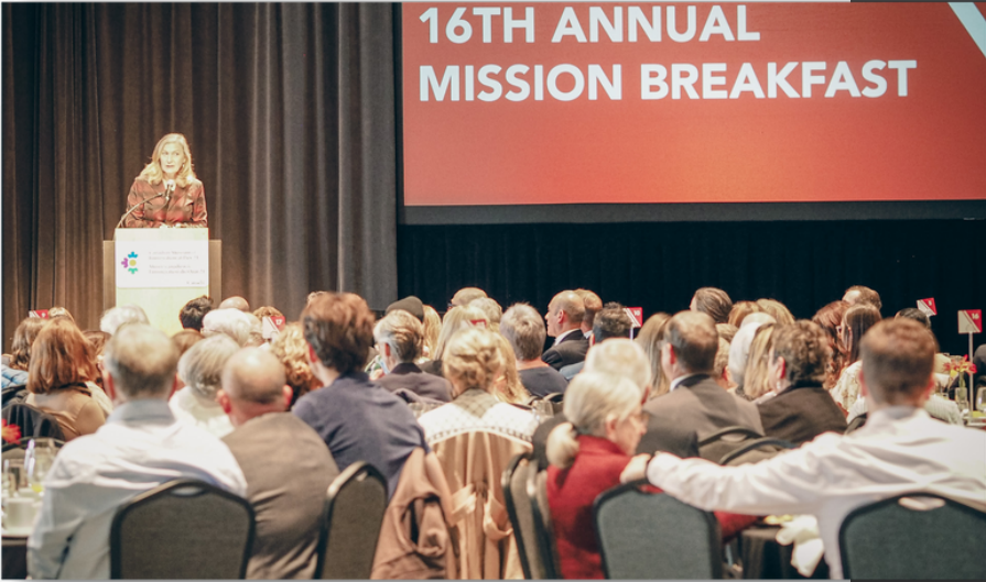
Anna Maria Tremonti challenged and inspired a full house.

We also heard from one of our clients who, through the support she received at Brunswick Street Mission, was able to say, "I forgot that I was homeless."