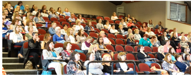
A crowd of dental hygienists at the recent AGM held at McNally Main Theatre, Saint Mary's University.