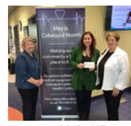
Kinette Club of Sackville