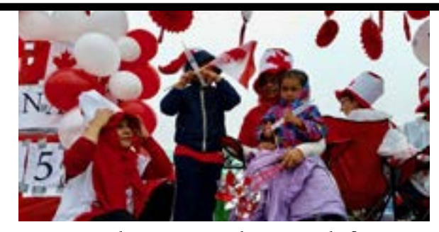
Some volunteers enjoying their time on the float during the parade.