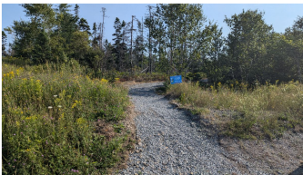
The new trailhead at BMO Soccer Centre on 210 Thomas Raddall Drive.