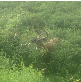
A white-tailed deer around the Mainland Common.