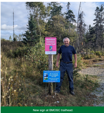
New sign at BMOSC trailhead

A sign was installed at the BMO Soccer Centre trailhead of the new extension of the Loop Trail.