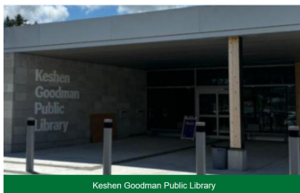
Keshen Goodman Public Library

This Winter, Halifax Public Libraries is offering the borrowing of walking poles and ice grips that slip over footwear. Inquire with your local branch about borrowing what you need for a safe Winter walk.