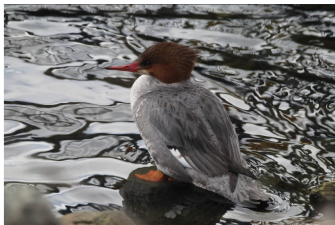
Common Merganser at the Mill Run Trail.