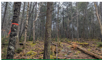
Hillside where part of the new trail will be.

We've been assessing the terrain in the Mainland Common where we plan to build a new trail extension through the woods.