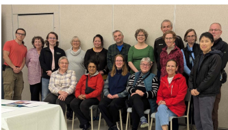
Our members and guests attending the AGM.

Of greatest concern to us is the encroachment into Sandy Lake and the Blue Mountain Birch Cove Lakes Wilderness Area west of Highway 102.