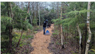
Spreading new wood chips.

We had a trail maintenance event on the wood chip trails of the Mainland Common despite the rain.