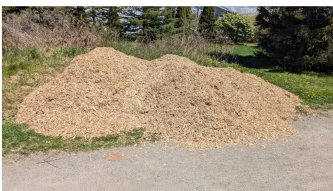
Another batch of wood chips.

Several wheelbarrows will be used to transport the wood chips and rakes used to spread them on the trail. Some extra pairs of work gloves will be available and we encourage volunteers to bring their own if they have them.