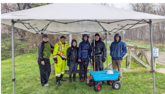
Most of our group gathered out of the rain.