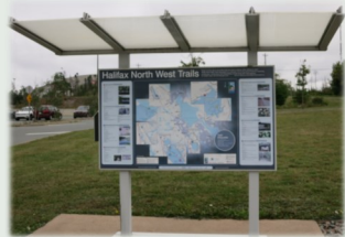
Visit our Kiosk at the Canada Games Centre

The Halifax North West Trails Association is one of many volunteer community trail groups in Halifax. We support the use of trails in Fairview, Clayton Park, Rockingham, Bedford South, and the Blue Mountain-Birch Cove Lakes Wilderness Area. Our trails offer a variety of outdoor experiences for cycling and walking commuters, casual urban walkers, nature enthusiasts, and hikers who enjoy a path in the woods. Many of the trails pass through historic areas connected with the ongoing development of Halifax and pass near brooks, wetlands, and woodlands where numerous flora and fauna can be found.