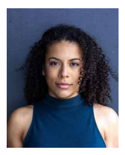
1) What's your hometown? I was born in Toronto but grew up in Halifax.