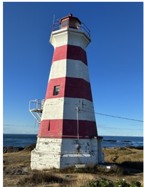
Brier Island Lighthouse Aug 2025