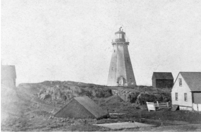
2 nd Brier Island Lighthouse 1901