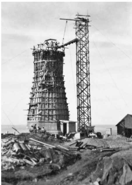
Building the 3 rd and current Brier Island Lighthouse

The burned lighthouse was replaced with one made of reinforced concrete and it also sports three red bands around its white tower just like the previous lighthouse did. In 1987 the lighthouse became automated and in 2022 its ownership was transferred under the Heritage Lighthouse Protection Act to the Municipality of the District of Digby with non-profit group, SAIL2, responsible for its maintenance.