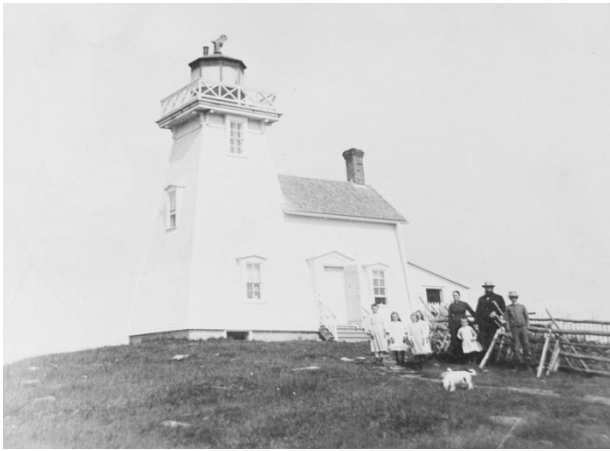
First lightkeeping family at Croucher Island 1890