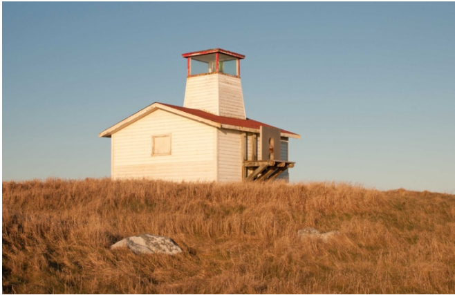
Berry Head Lighthouse