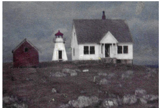
2 nd Tor Bay Lighthouse