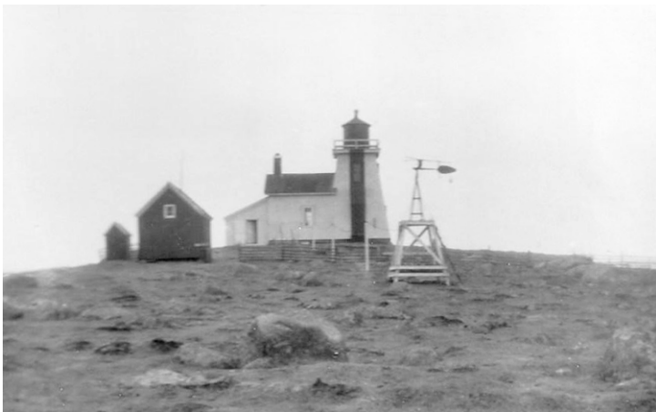
1 st Tor Bay Lighthouse

If you are up for a 3 km (1.9 mi) hike this summer, you can walk from Tor Bay Provincial Park to Berry Head Lighthouse. This unique-looking lighthouse erected in 1985 once had a very traditional look and a different name. In 1876 the first lighthouse on site was a tall tower with an attached lightkeeper's dwelling. The tower was painted white with red vertical stripes and had a black lantern that showed a red fixed light coming in from sea and a white fixed light heading out. Called the Tor Bay Lighthouse, its unique daymark and light characteristics allowed mariners of that time to determine their navigational position. In 1951 the station was rebuilt with a smaller standalone white pepper-shaker tower with a 3 bedroom dwelling next to it. This lighthouse was not to last long beyond automation in 1959. Neglect and vandalism over the next 20 years took their toll and many unused buildings were burned in 1972. The local fishers then requested a new lighthouse that is the bare-bones one seen at Berry Head today.