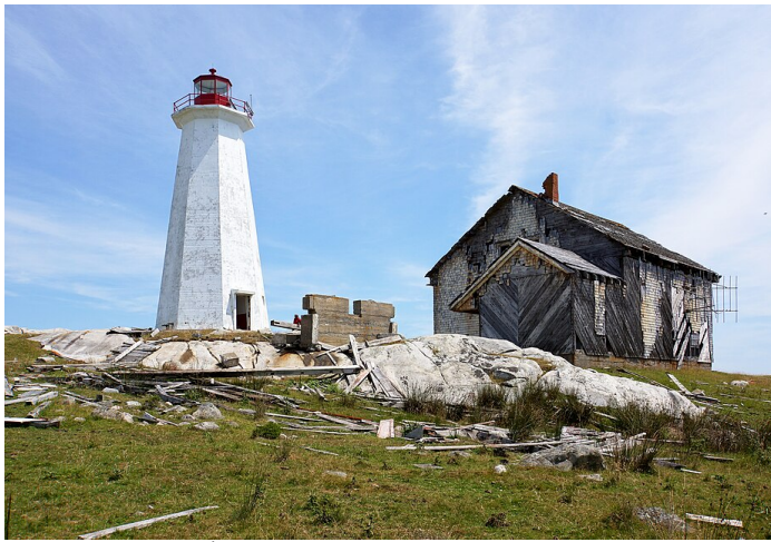
2 nd Cape Roseway Lighthouse