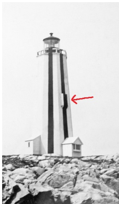
1 st Cape Roseway Lighthouse – arrow shows bow window

There were only three stone towers built in NS: Louisbourg in 1734, Sambro Island in 1758 and Cape Roseway in 1788. Cape Roseway Lighthouse was located on McNutt Island to mark the entrance to the long inlet leading to Shelburne. It displayed two fixed vertical lights - one shining from the lantern while the other shone from a bow window projecting out from one side of the tower. Only two small rooms were provided for the first lightkeeper, Alexander Cocken, and was quite a fall in status as Alexander had arrived in Shelburne in 1783 with a wife and three servants! Over the following years, other rooms and buildings were added, turning a simple lighthouse into an active and extensive light station. In 1959 the lighthouse was hit by lightning and heavily damaged by fire. A temporary light was put on the roof of the fog-alarm building until a new concrete tower was built and connected to electricity in 1961. In 1986 the station was de-staffed and only the Cape Roseway Lighthouse remains in reasonable shape as an aid to navigation.