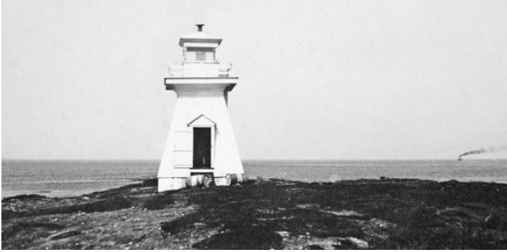
Tanner Island Lighthouse 1933