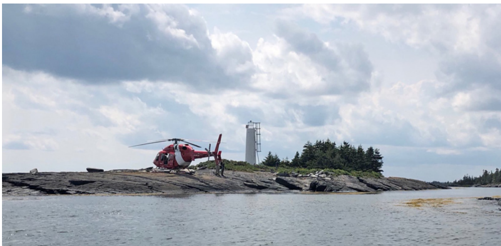
Gunning Point Island (aka Tanner Island)

Today the fiberglass tower is gone and in its place a skeletal steel tower flashes a white light year round. Does anyone know when?