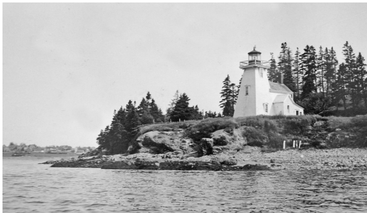
1 st Jerome Point Lighthouse 1933