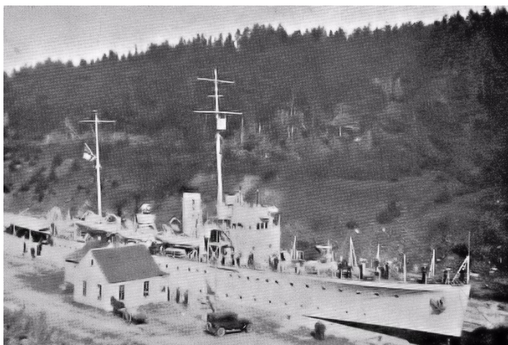
HMS Scarborough St Peter's Canal 1931