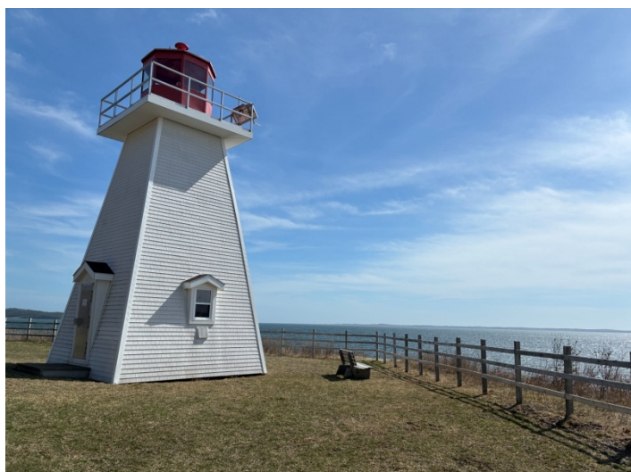
2 nd and current Jerome Point Lighthouse

With the arrival of bigger ships following the war, St Peter's Canal was limited to fishing and pleasure craft. Still in 1956 a new white wooden pepper-shaker tower was built that included a hookup to electricity. Lightkeeping duty passed to the canal lockmaster in 1962. With the installation of a 4-bulb automatic changer and an on/off light sensor switch in 1965, the lighthouse became automated and now operates seasonally from May to November.