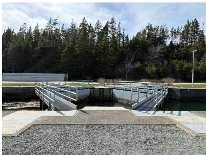
St Peter's Canal Tidal Lock May 6 2026