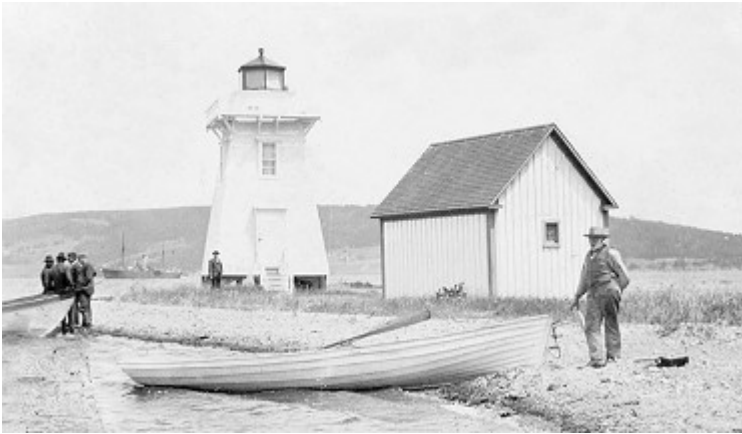
Original Kidston Island Lighthouse