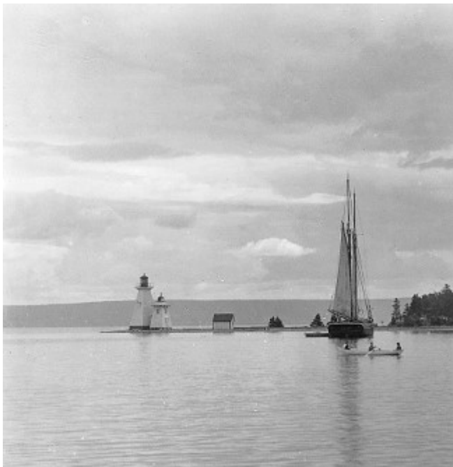
First and 2 nd Kidston Island Lighthouse side by side

Baddeck in Cape Breton has so long been associated with Alexander Graham Bell's inventions that it is little known that it was once a busy port on the Bras d'Or Lake when farm produce plus gold and gypsum were loaded onto ships bound for foreign destinations. To indicate safe passage a small square white pepper-shaker style lighthouse was built in 1875 at the northeast tip of Kidston Island that acts as a natural breakwater to the Baddeck harbour. Kidston Island was close enough to the mainland that the lightkeeper was given a boat to sail from his house in Baddeck to do shifts at the lighthouse. In 1912 a taller version of the lighthouse was built to better guide mariners and yet the old lighthouse was allowed to stand beside it before being demolished in 1959. Another curious fact was that the light was at first seasonal, then made year-round in 1962 to allow travel on winter ice, and is now listed as being seasonal again. Still can you imagine walking along on the ice by the light of a lighthouse?