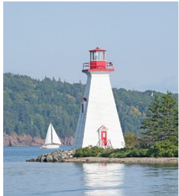
2 nd and current Kidston Island Lighthouse 2012