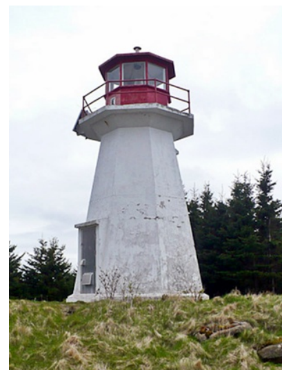
3 rd Margaree Island Lighthouse