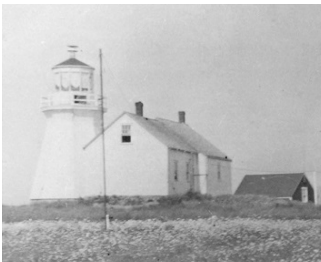
2 nd Margaree Island Lighthouse

During the period 1956 to 1958 a new hexagonal tower made of reinforced concrete was erected and the lightkeeper got a new wooden frame house! He only got to enjoy it 13 years before the light was automated and his job eliminated. Today only a huge colony of Great Cormorants live on Margaree Island where a lighthouse has shone a guiding light for 171 years!