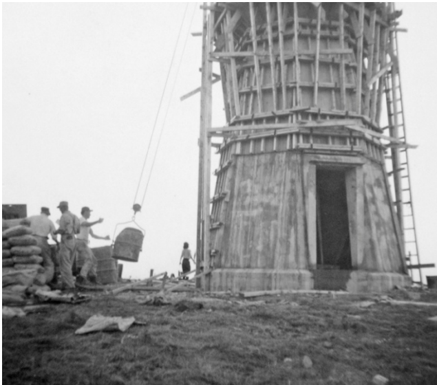
At the base of new concrete lighthouse tower