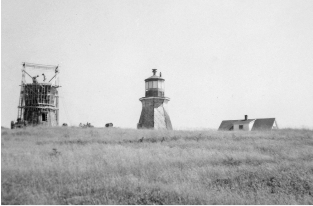
2 nd Margaree Island Lighthouse with 3 rd concrete lighthouse construction in progress Note the 2 nd tower appears to be missing its outer layer. Was the wood used as concrete forms for the 3 rd one?

Here are some rare photos of constructing a concrete lighthouse in the late 1950s: