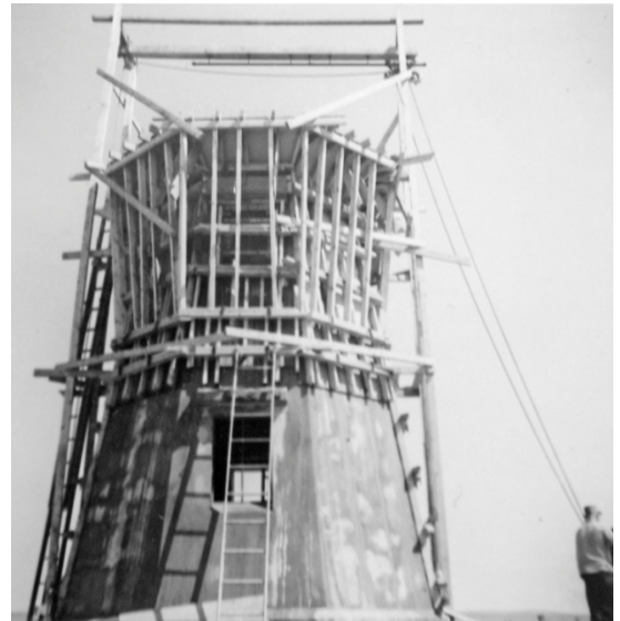
Adding the second floor to the tower base