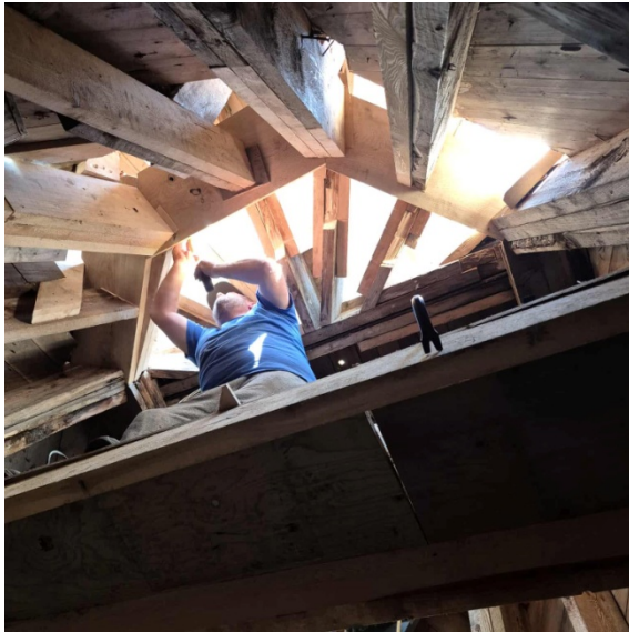
Fixing the support structure