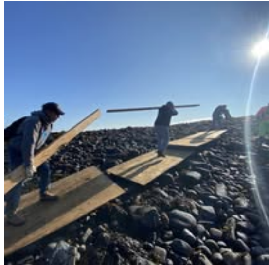
Bringing materials ashore