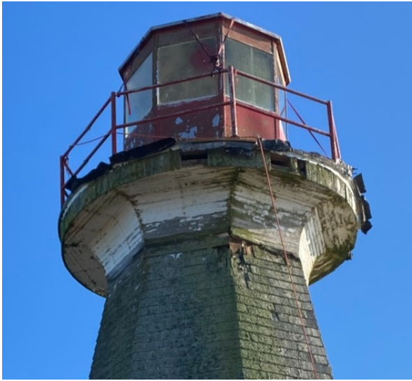
Peter Island Lighthouse before Phase 1 fix