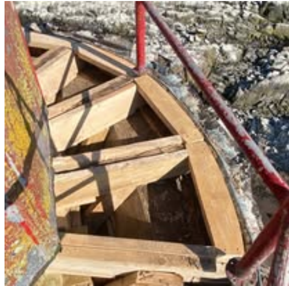
Rebuilding the gallery deck