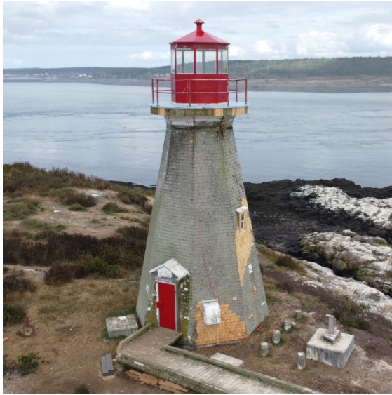
Peter Island Lighthouse post Phase 1 fix