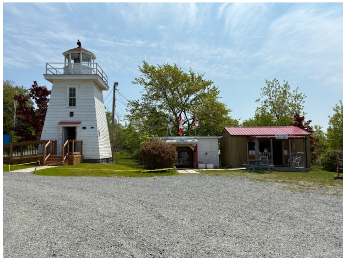
Walton Harbour Lighthouse June 2025

If you visit Walton Harbour Lighthouse this summer, you will be surprised to see a wooden gazebo where the lighthouse once stood. What happened? The cliff nearby is made of sandstone, a material that is quite porous and erodes easily. As the distance from the original site of the lighthouse to the edge of the cliff got smaller and smaller, it was time to move the lighthouse to a safer spot. The lighthouse was turned 180 degrees and put on a new foundation next to the minimuseum that has info-boards about the barite and gypsum mining in the area. Ships were used once to transport these minerals, one reason for Walton Harbour Lighthouse being built in 1873. Moving the lighthouse provided the opportunity to build a proper ramp for users of walkers and wheelchairs to access the ground floor of the lighthouse. An hour from Dartmouth, the lighthouse is open daily from 8am to 8pm, has picnic tables and flush toilets. Well worth the drive!