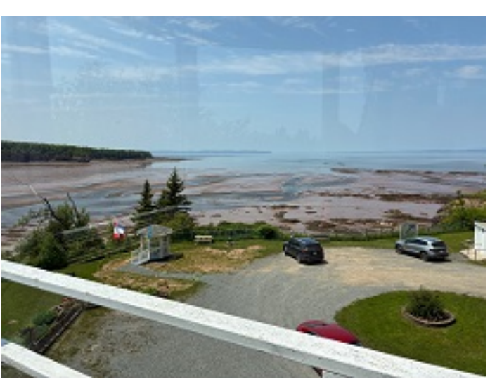
View from new site