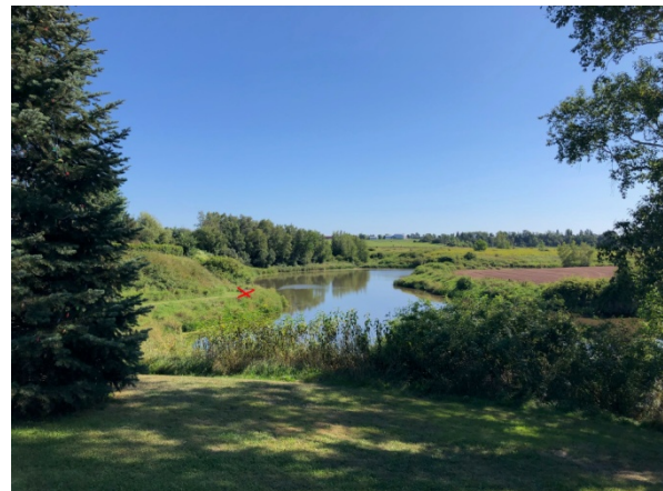
Red X marks potential site in Bruce Spicer Park