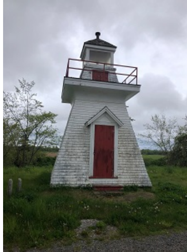
Borden Wharf Lighthouse