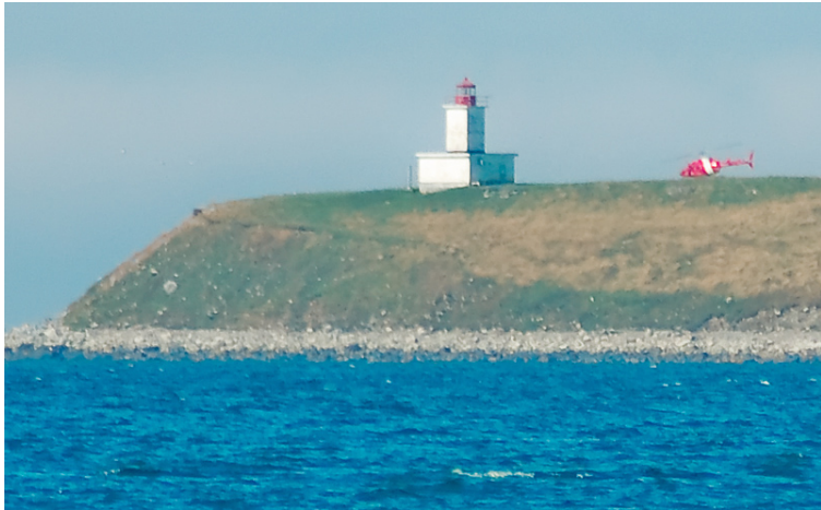
Whitehead Island Lighthouse pre-2017