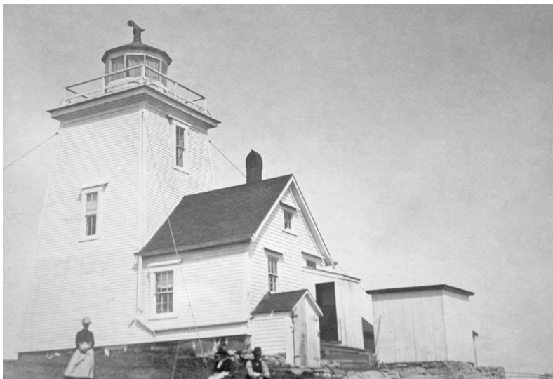
Whitehead Island Lighthouse 1892

In 2017 the fog horn building was removed from the base of lighthouse and two red bands painted around the lighthouse tower to tell it apart from other lighthouses in the area.