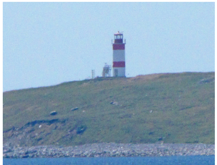
Whitehead Island Lighthouse 2017