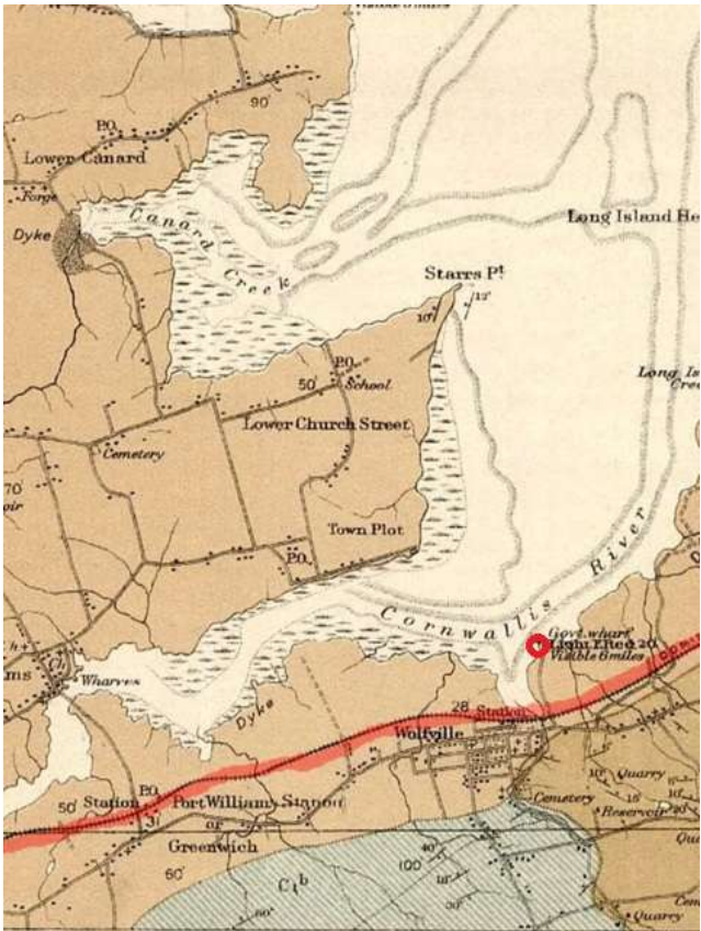
Red circle marks lighthouse site; Red line Dominion Atlantic Railway