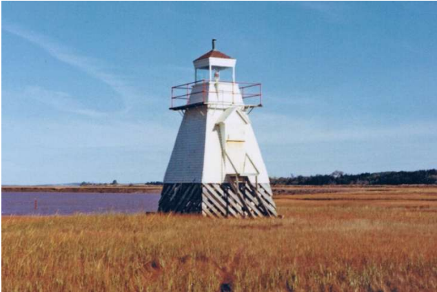
Wolfville Lighthouse in hayfield

On the 2026 bucket list: to visit Wolfville’s Waterfront trail and walk along the dykes towards Grand Pré. Why? There once was a lighthouse that stood on the government wharf. Built in 1902 it was a white pepper-shaker style tower that guided ships down the Cornwallis River to the wharf located at the mouth of Mud Creek.