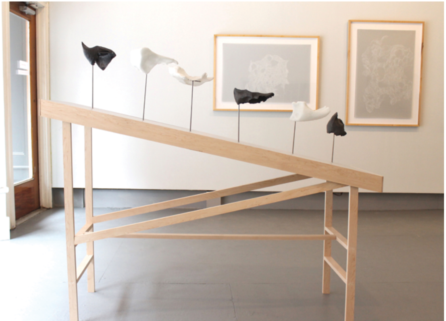
Trace Erase: Iceberg casts, 2017.