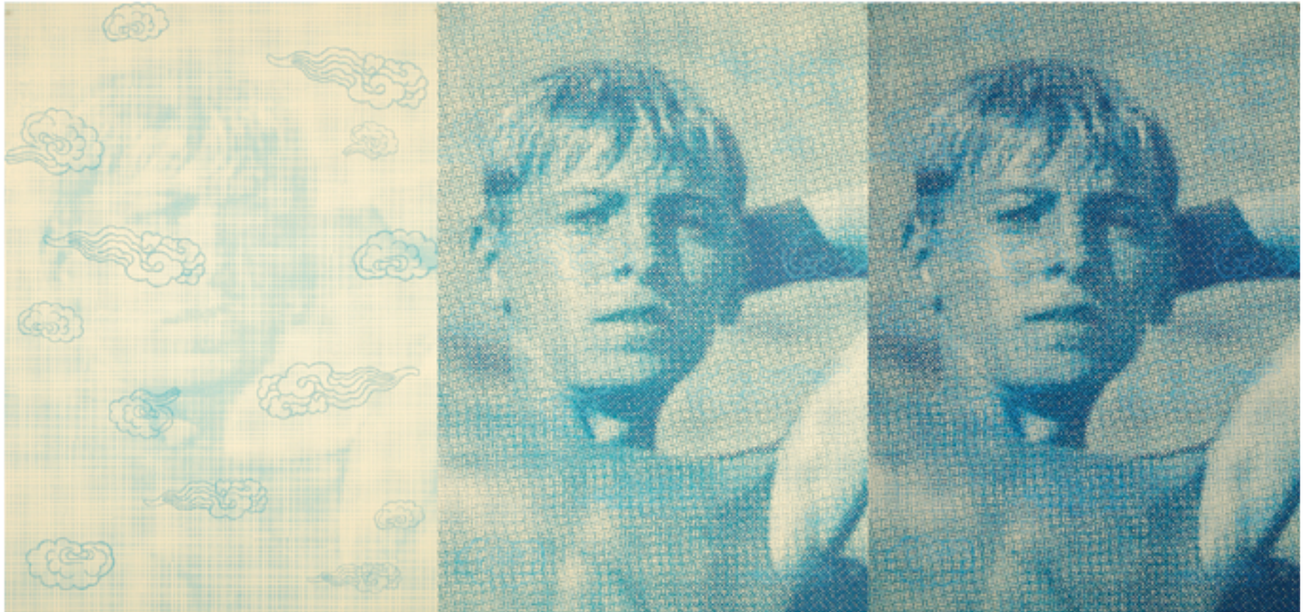
Blueboy.01.copy.jpeg , 2015.