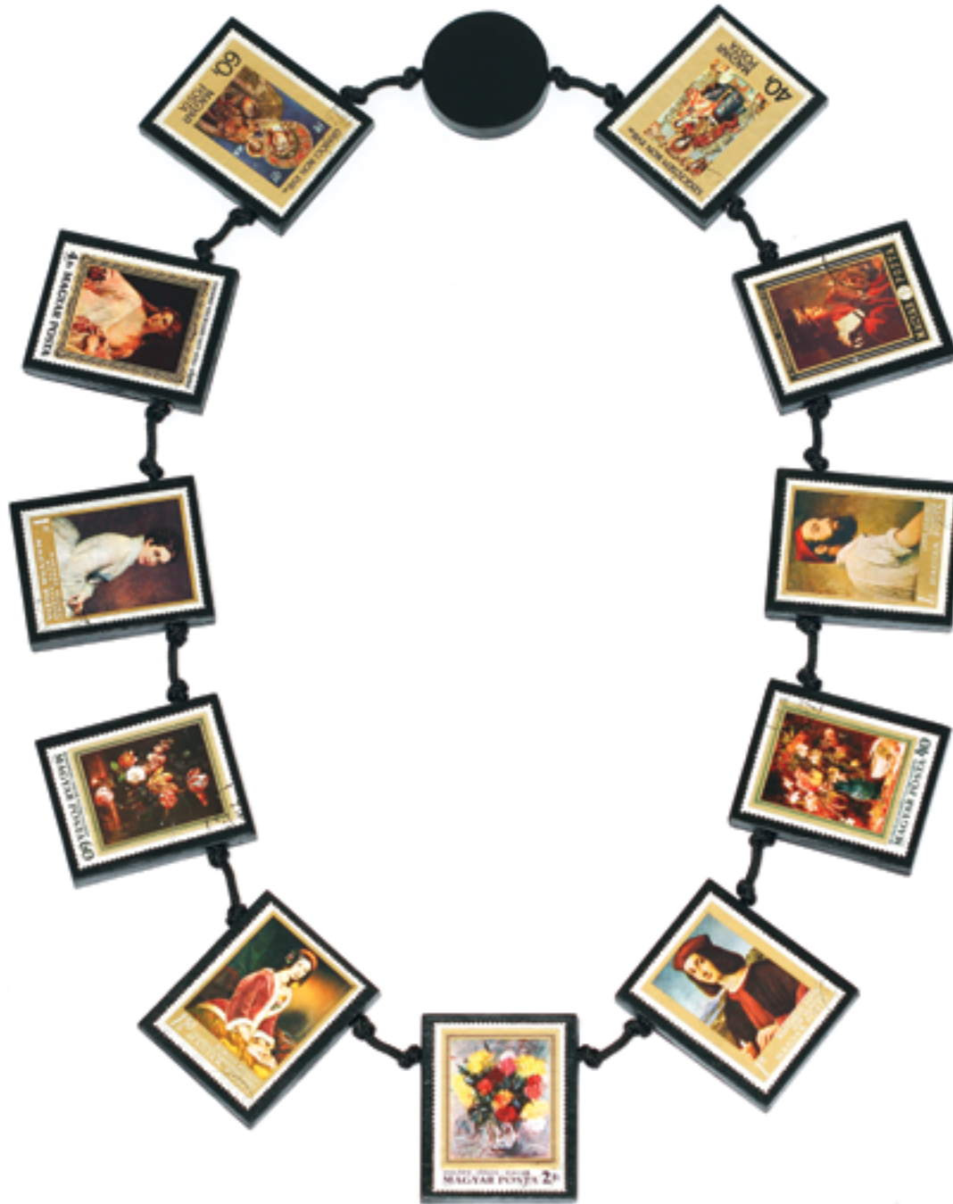
Chain of Office, 2017.