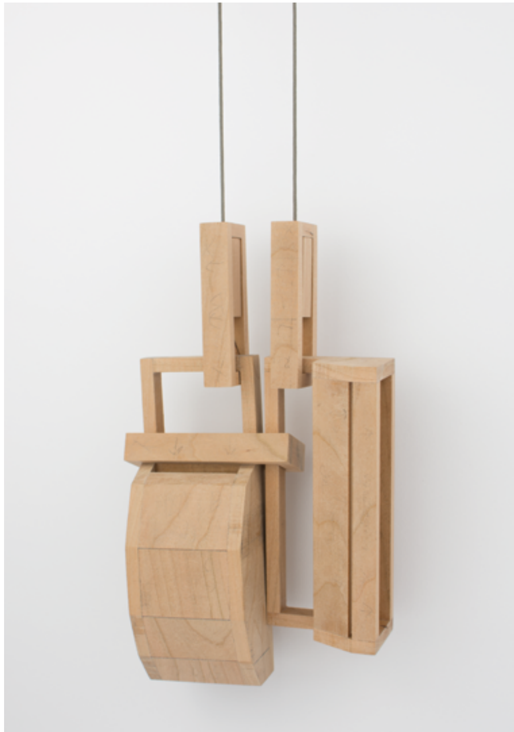
Echoes 16, 2018.