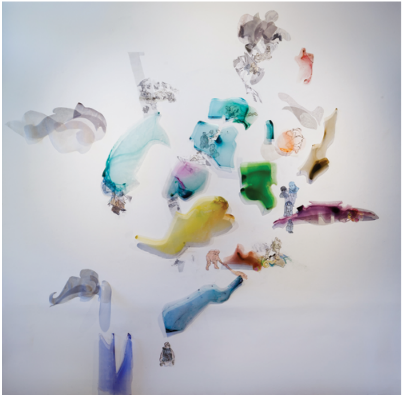
Sara Hartland-Rowe, Double Vision , 2018. Lexan film, polyester organza, watercolour, collage and acrylic on site-wall, 14' × 18'.