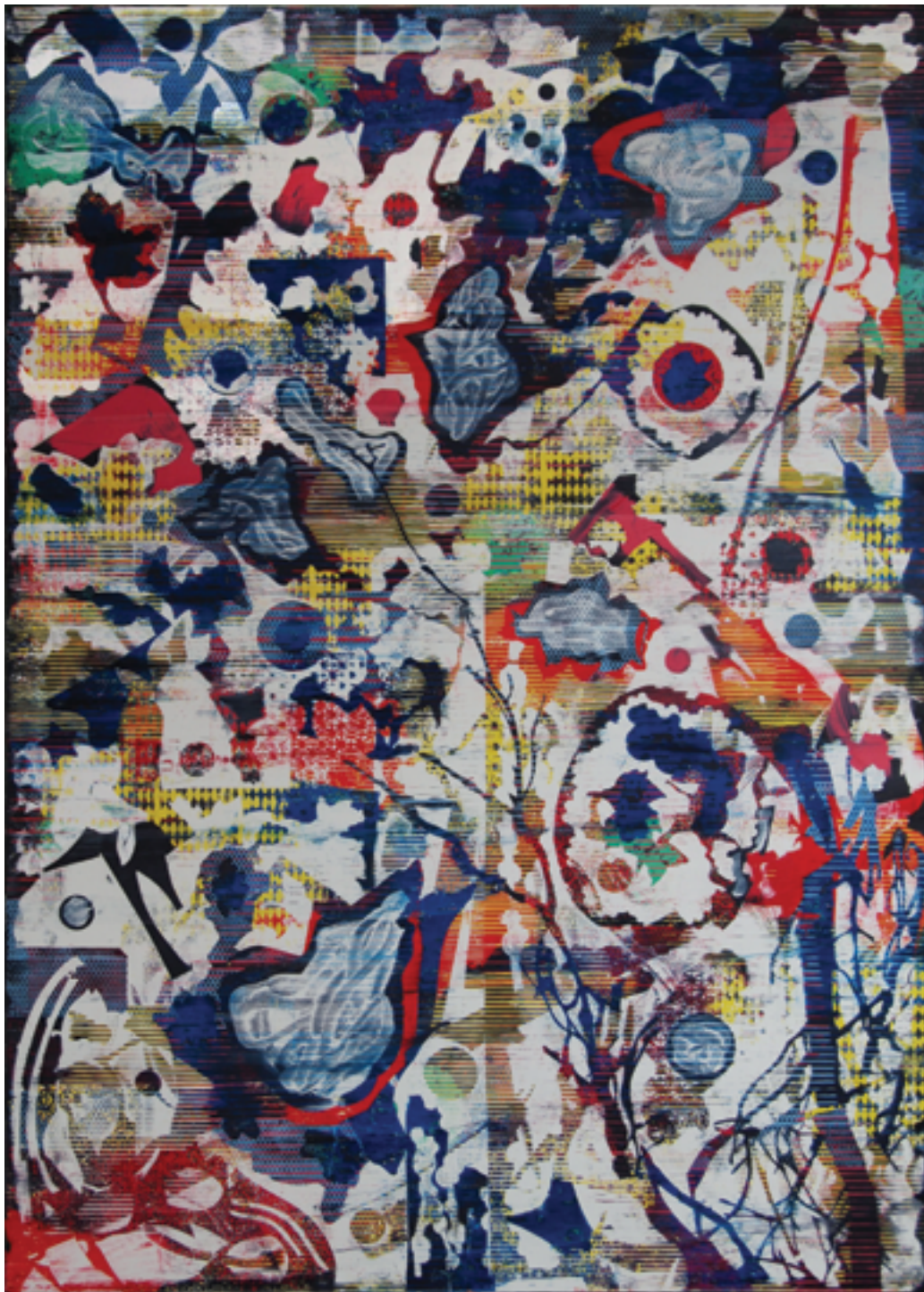
Meshed redirect, 2016.