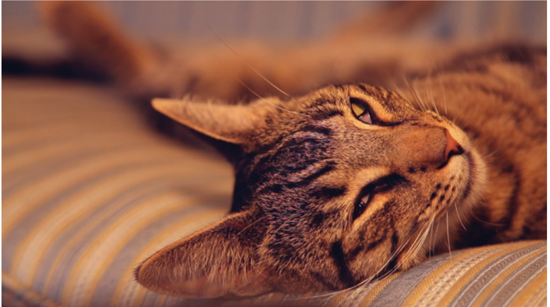
Here is Everything (detail), 2013. Video Still