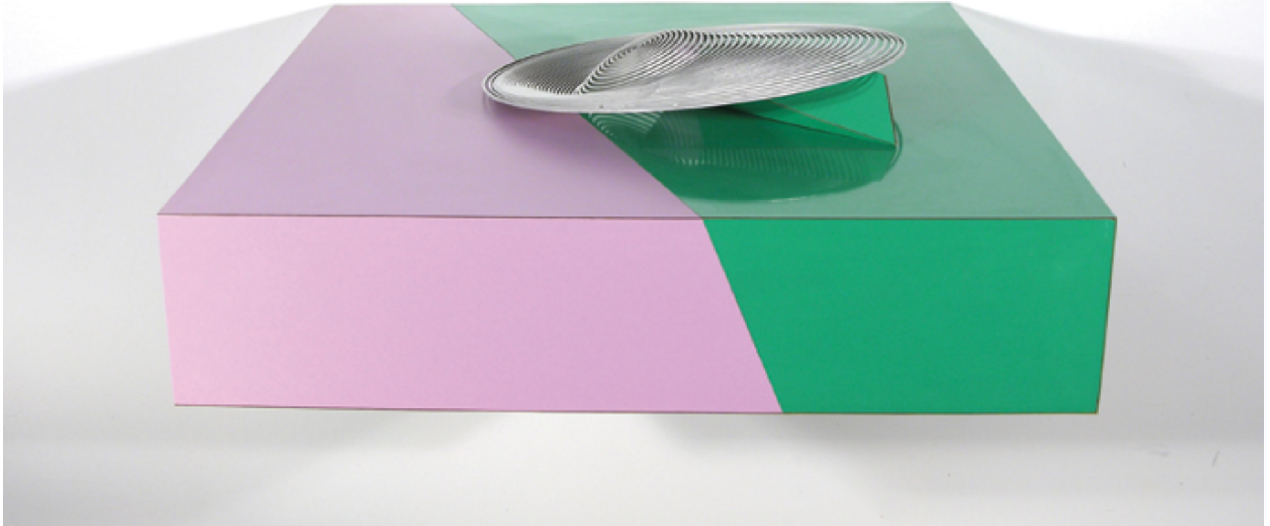
Bubble , 2014.