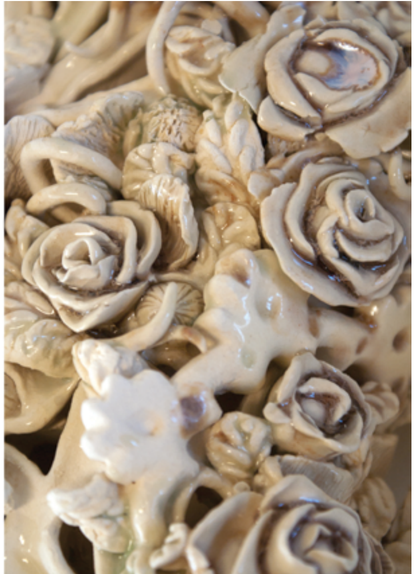
Borrowed Time , 2016.