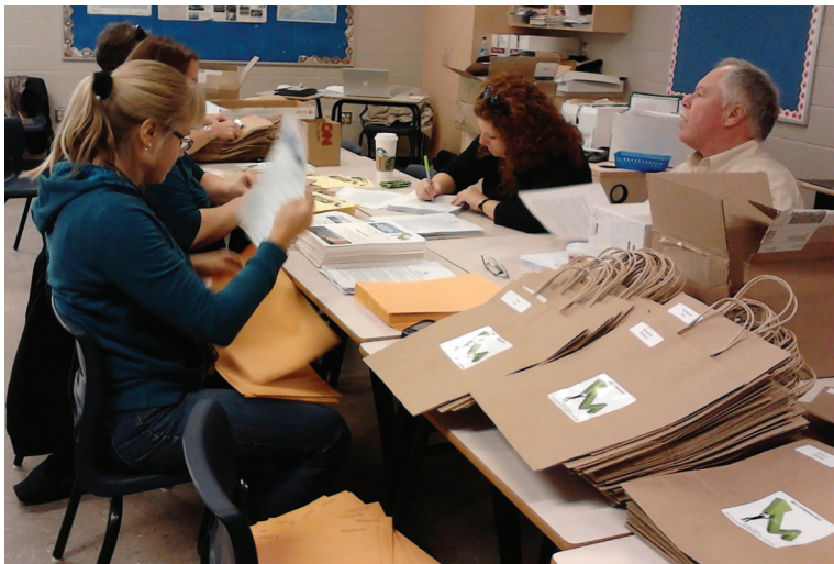
Putting together conference kits.

Chart your course with us at www.ssta.nstu.ca . Like us on Facebook “Social Studies Teachers Association of Nova Scotia”, or follow us on Twitter @NSSSTA Happy Navigating and Happy Birthday!