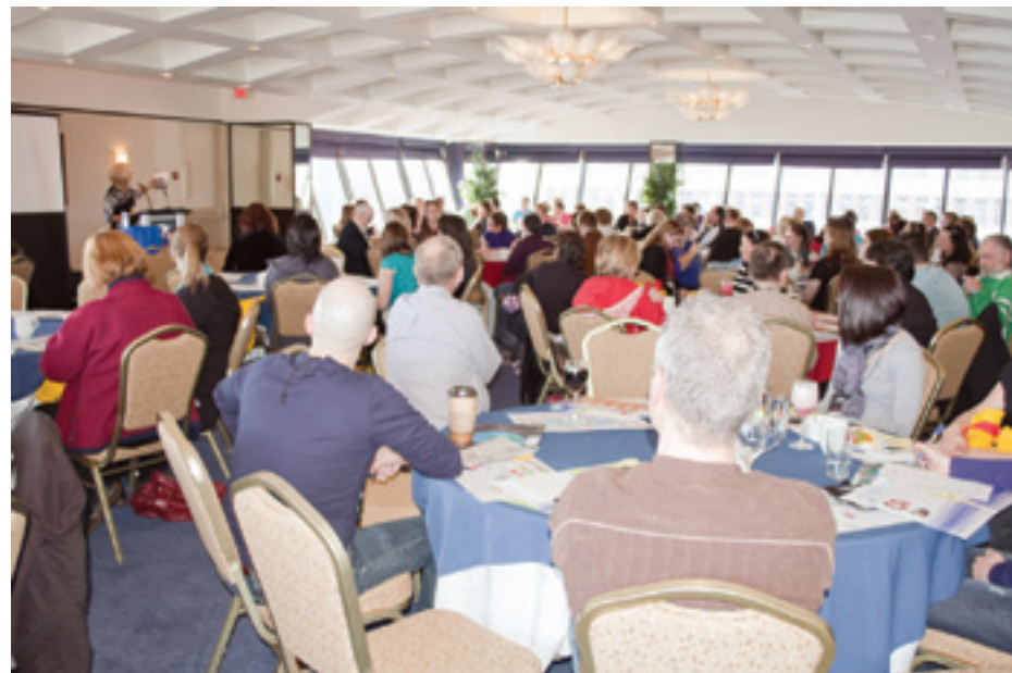
Over 150 teachers attended the Peace...ing It Together conference.