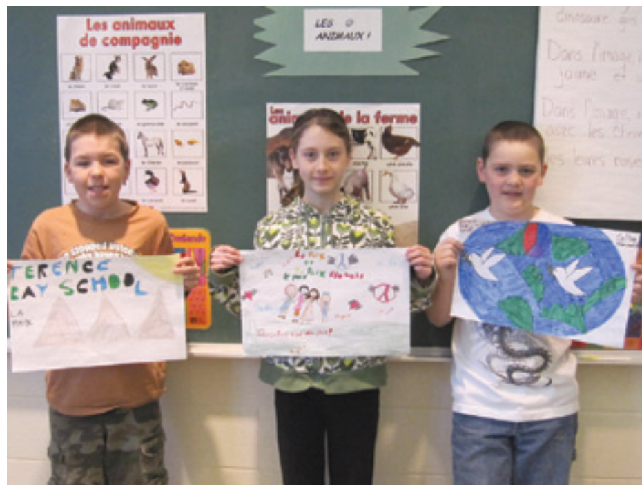
The NSTU sought artwork from students from around the province to adorn the walls and the tables for the conference. Above are students from Terence Bay School displaying some of their artwork.

Other workshops included How to Tame a Bully , Digital Citizens—Appropriate Online