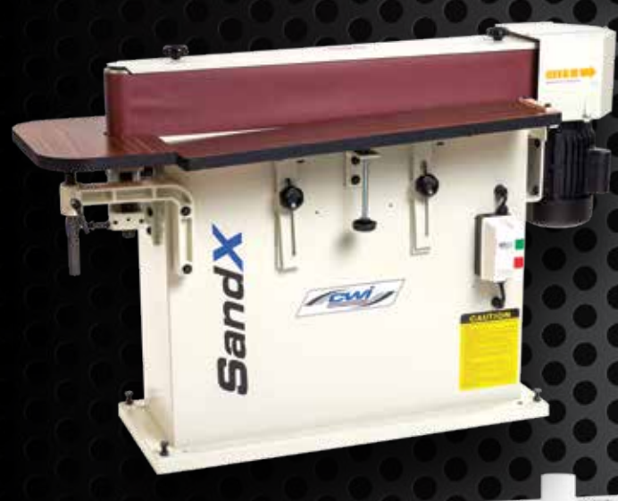
SANDX 6" X 108" HEAVY DUTY EDGE SANDER