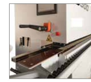
Chain Drive Feed System