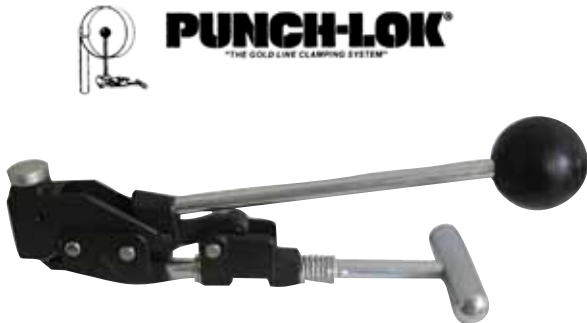
T-1 Punch Lock Tool Outil pour Punch Lock T-1