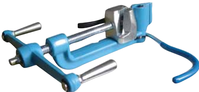
Band and Buckle Tool PB-001 Outil PB-001 bandes et attaches