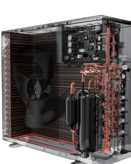
100Hz operation for 100% of rated performance even