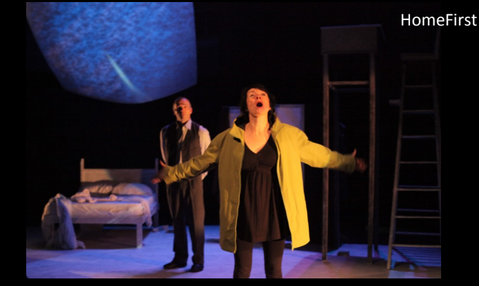
The Doppler Effect