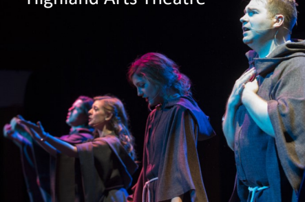
Highland Arts Theatre