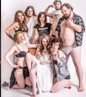
Rolling Bold Productions