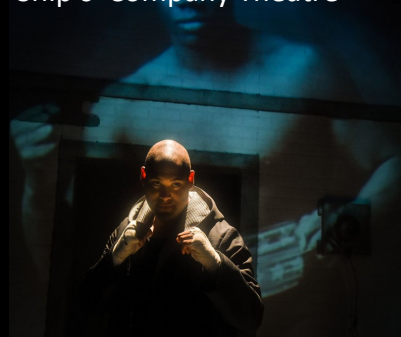
Ship's Company Theatre