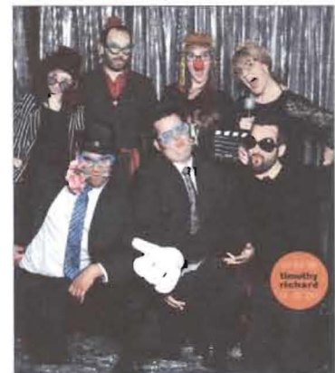
Merritt Awards 2013