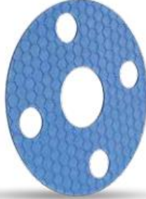
Style 3504 EPX Aluminosilicate Microsphere